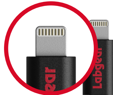
MFI approved connector