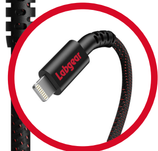
Tested for over 100,000 bends at \pm 60^\circ under a 300g weight load.