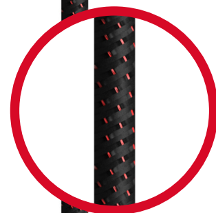
Reinforced with 6 strands of 1000D Kevlar fibre.